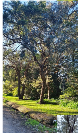
Straight or crooked?