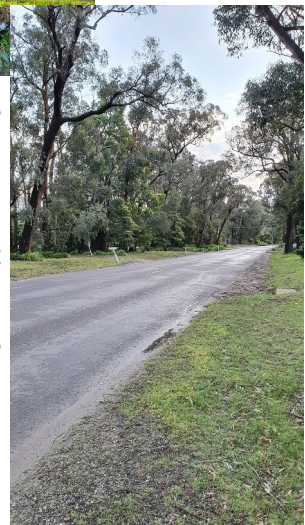
It all depends on which way you look at it