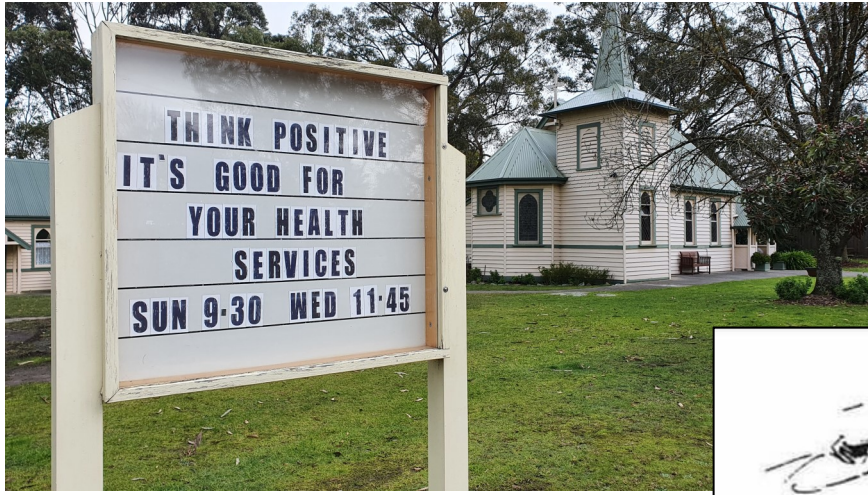
St Thomas' Anglican, Bunyip