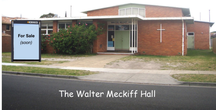
The Walter Meckiff Hall