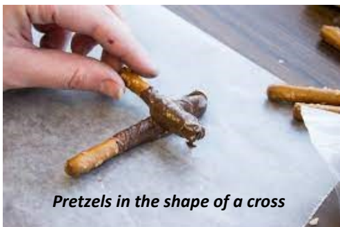
Pretzels in the shape of a cross